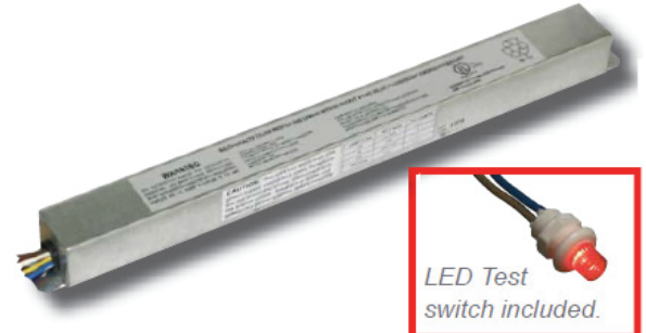
LED Test switch included.